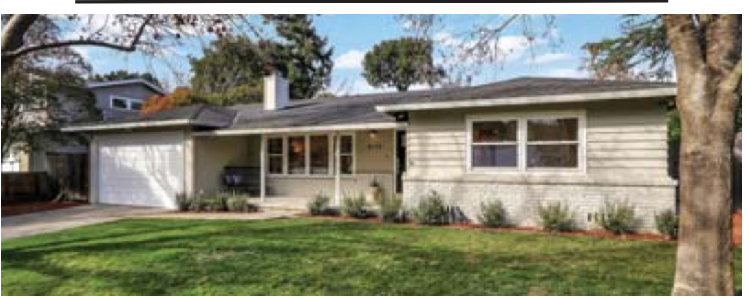
3176 Rohrer Drive, Lafayette | Burton Valley Neighborhood Represented the Seller | Listed at $1,225,000 | Pending with 9 offers

The Bay Area market continues to attract more buyers than sellers and low inventory is keeping the market strong. Homes in our area continue to be in high demand. This is a great time to sell your home. Call us to learn about the home-selling process.